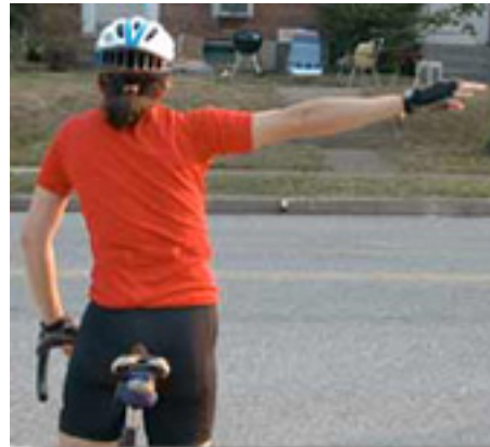
Also means right turn

Now that you've learned those hand signals, we'd like to give you a big thumbs-up for finding out more about bike safety!